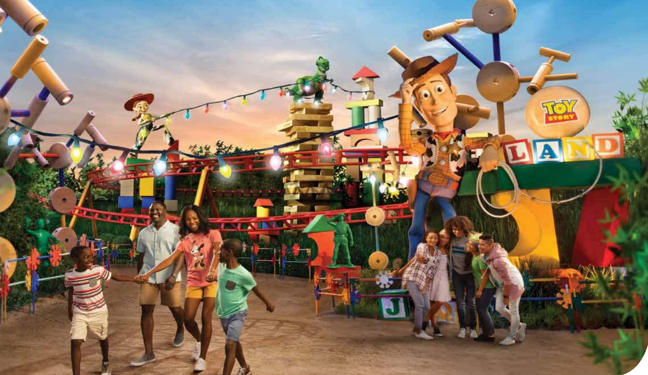
Artist Concept Only © Disney•Pixar