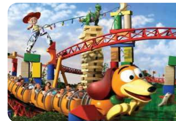
Artist Concept Only